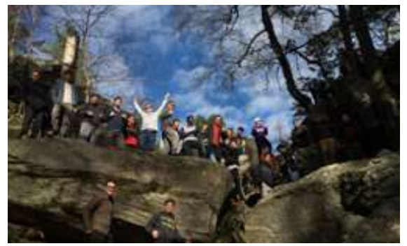
Purgatory Chasm Rush Event