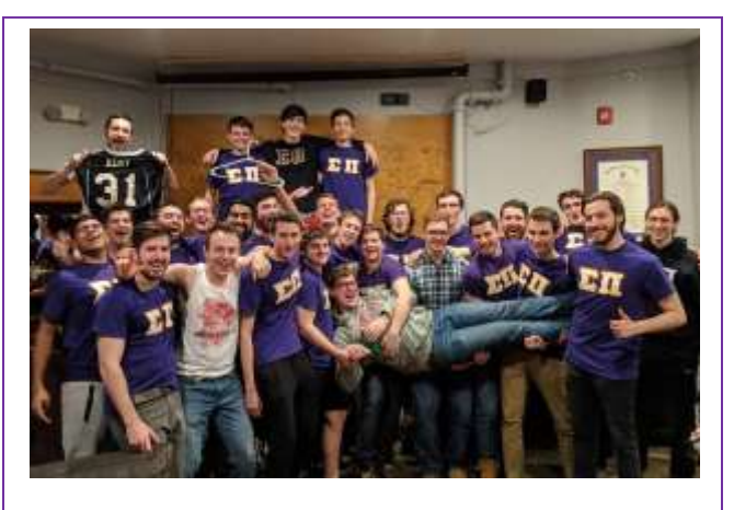
Newly initiated and older brothers during Initiation Night