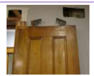
Creative Repairs to the Pocket Doors