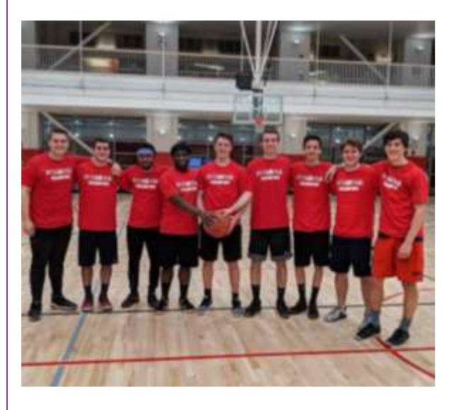
The Sigma Pi Intramural Basketball Champions