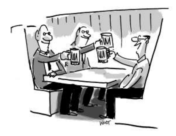
"Here's to vague college memories that keep 3 old guys without much in common anymore sharing a drink once a year."