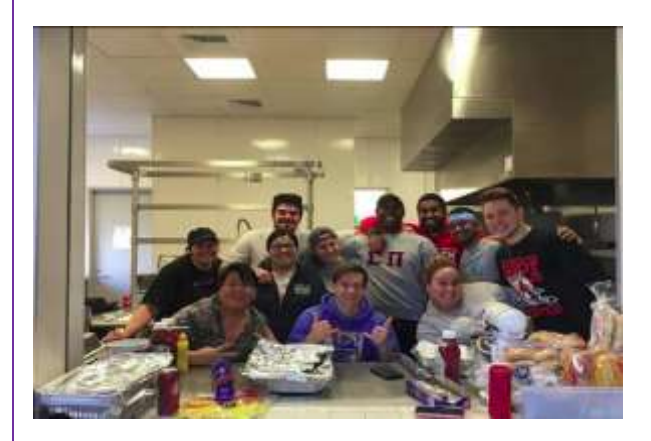
Brothers volunteering at the local Worcester Boys and Girls Club