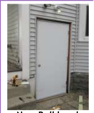
New Bulkhead Door