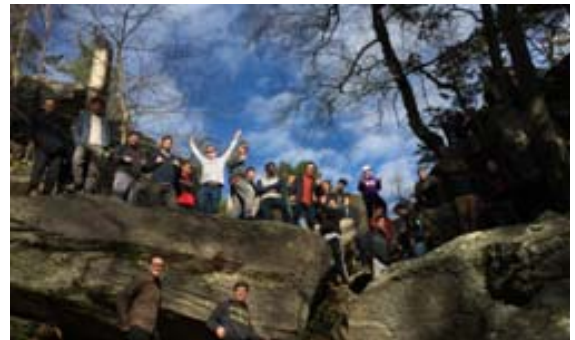
Purgatory Chasm Rush Event